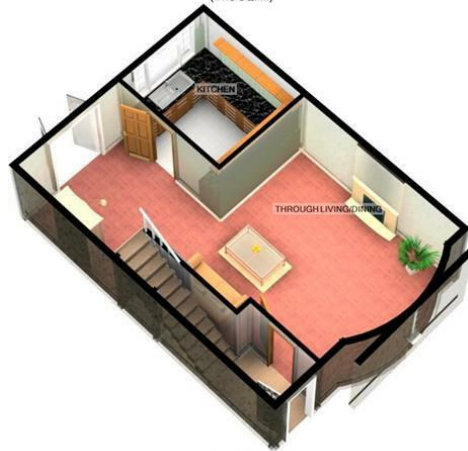
GROUND FLOOR APPROX. FLOOR AREA 452 SQ.FT. (42.0 SQ.M.)